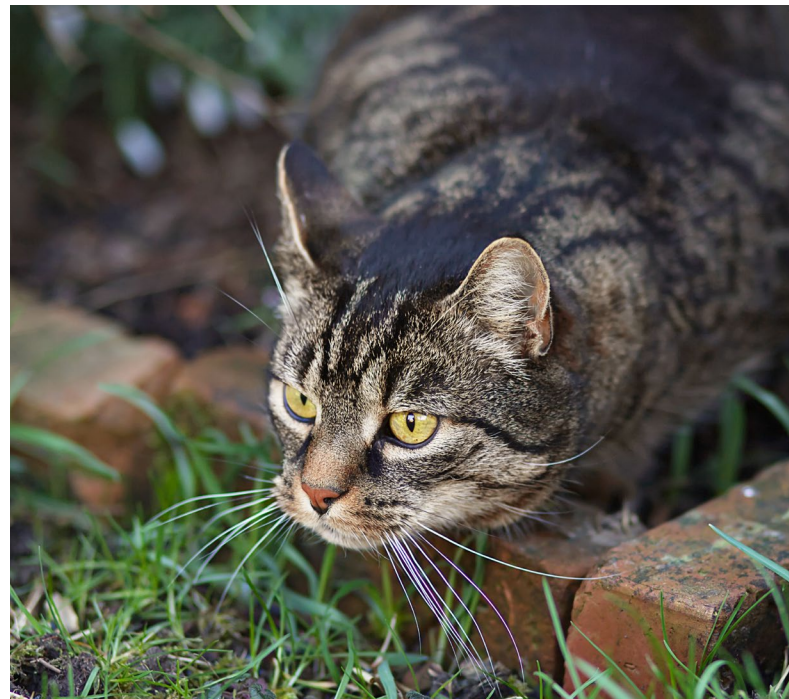
Limit the opportunities of an ambush with thoughtful positioning of your feeding stations.

Fitting cats with collars that include a bell may also reduce predation, as it makes it more difficult for them to stalk birds without being noticed.