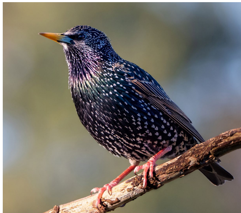
Starlings enjoy a wide variety of invertebrates, fruits and seeds throughout the year.

If you need to handle sick or dead birds, always wear protective gloves and wash your hands and forearms thoroughly afterwards. Pets should be kept away from any sick or dead birds.