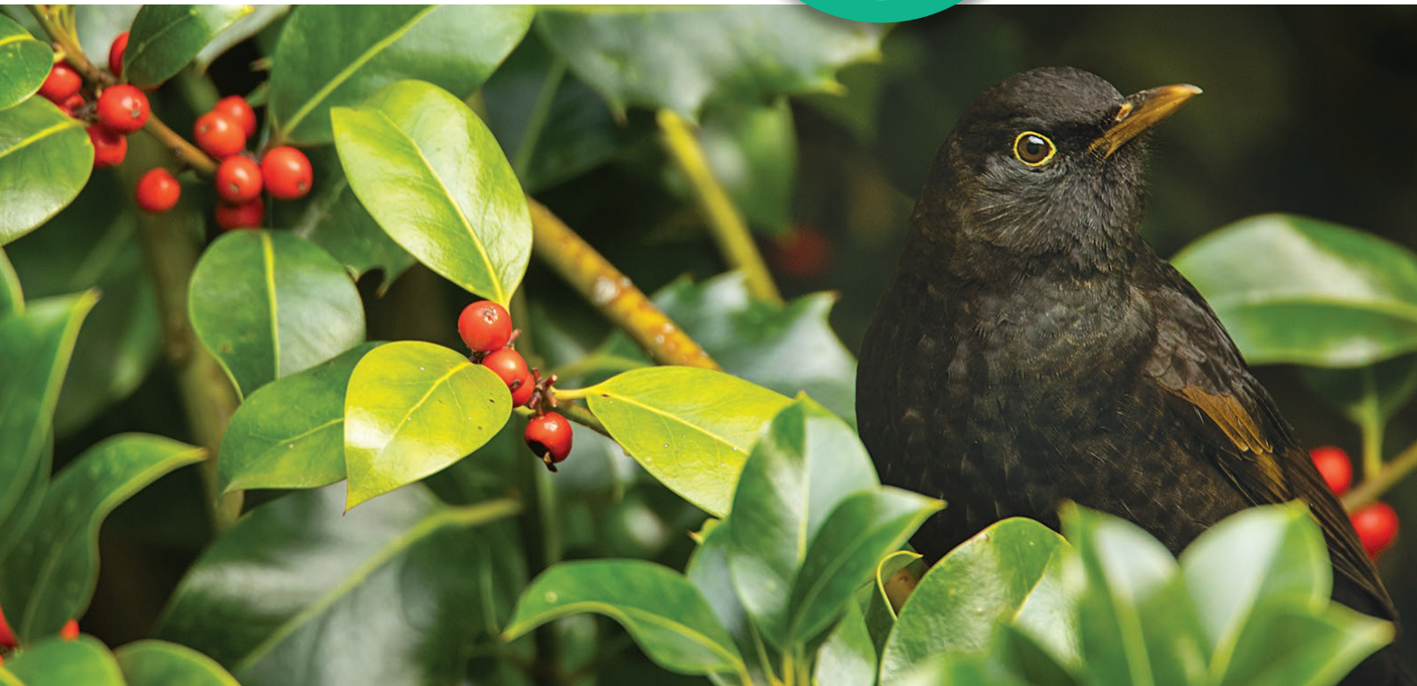
Placing feeding areas close to suitable cover can help provide escape routes for feeding birds.

Placing decals on windows and glass can help reduce potentially fatal strikes from garden birds.