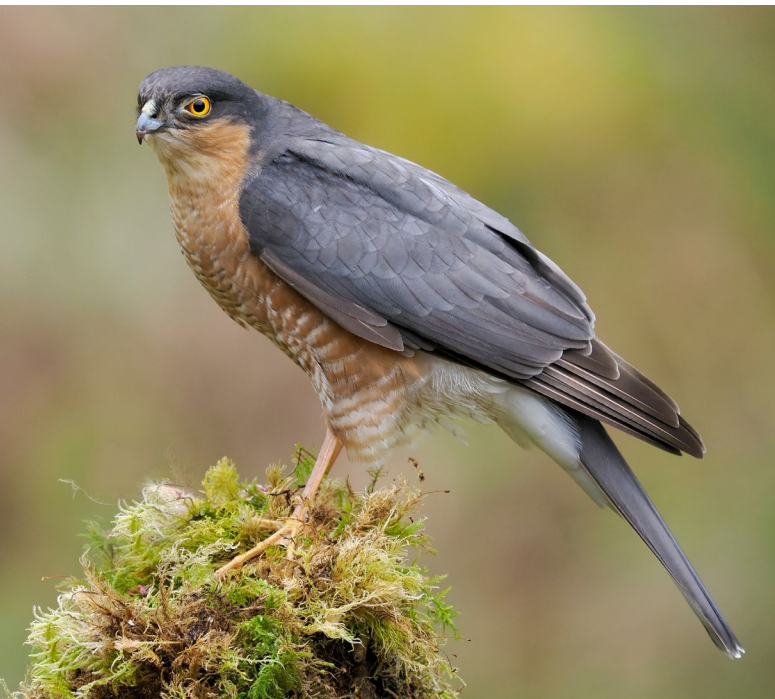
Predators such as sparrowhawks are a natural part of the ecosystem.

For those wishing to reduce predation risk, feeders should be positioned at an appropriate distance from cover such as bushes or hedges: far enough away to prevent ambush, but close enough to allow birds a quick escape.