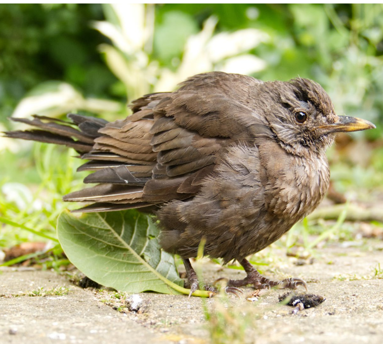
Birds with canker (trichomoniasis) often fluff up their feathers as a sign of being sick, weak or lethargic.

However, it is important to remain vigilant. Early detection and action limits the spread and the number of birds affected. In some cases, managing an outbreak may also involve coordinating with neighbours.